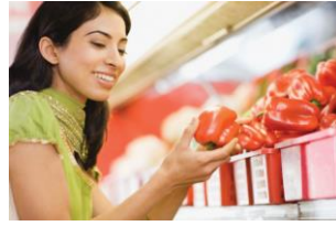
Food Distribution and Groceries