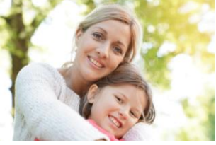
Domestic Violence Resources and Help