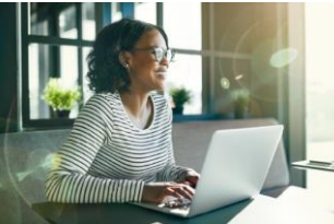
Financial Support and Programs