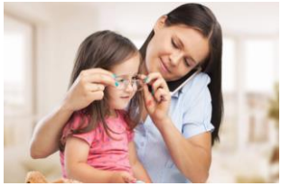
Housing and Shelter