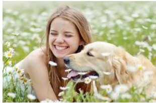
Behavioral Health and Mental Health