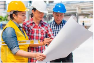
Employment and Unemployment Resources