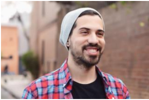
Substance Use, Addiction and Recovery