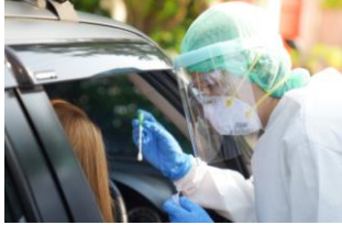
COVID-19 Information and Other Community Resources